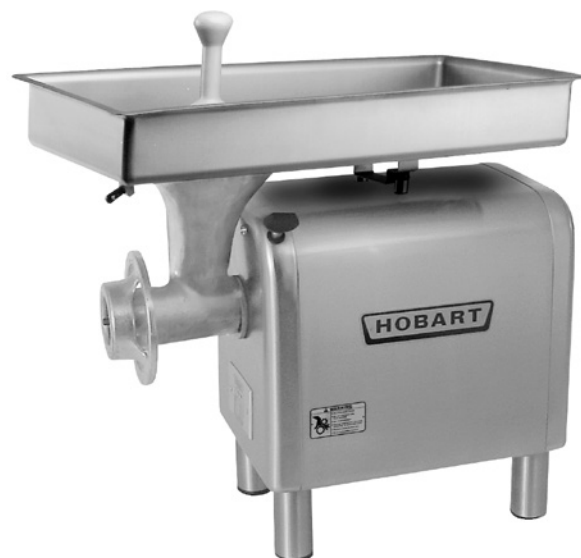
4822 with Optional Funnel Shaped Cylinder