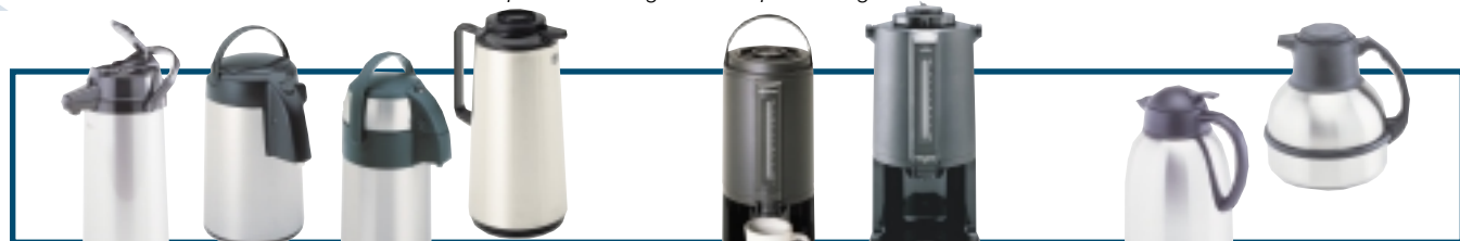
Complete line of Airpots for use with brewers with 13 3/8" clearance heights

ACCESSORIES: See the Bloomfield Brew product catalog for a complete listing of brewers and accessories.