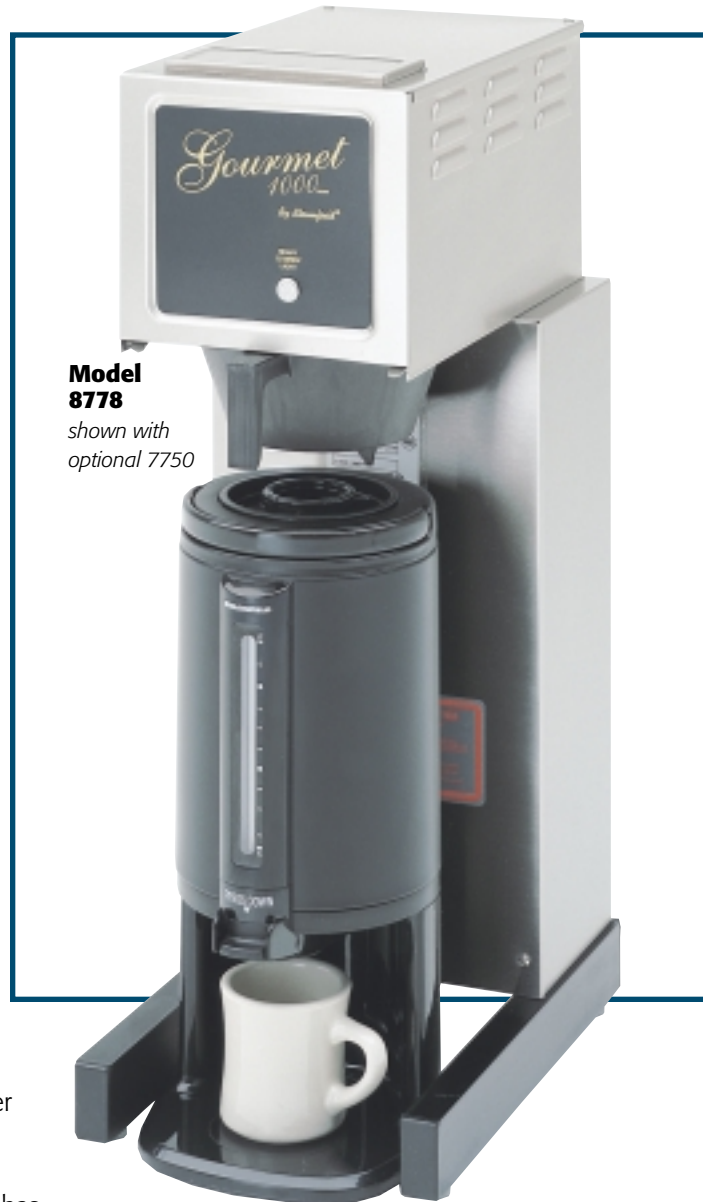
Model 8778 shown with optional 7750