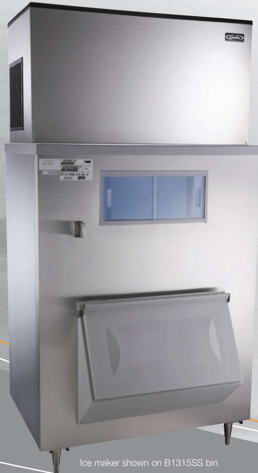
Ice maker shown on B1315SS bin