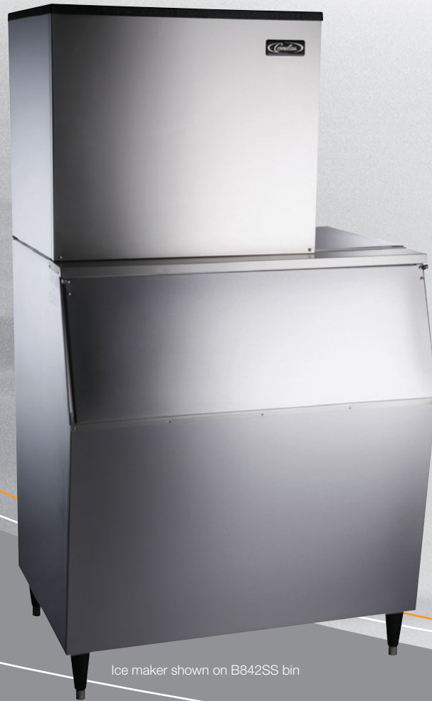
Ice maker shown on B842SS bin