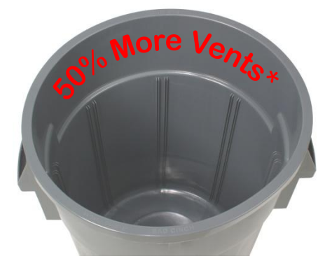
* Compared to competitive models