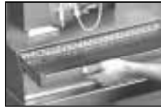
"Built-in" scrap tray saves space with innovative design.