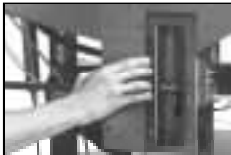
Power drain saves space, eliminates noisy solenoid and external sump. Drains quickly.