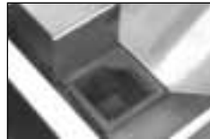
Self cleaning pump screen eliminates operator error. Saves service calls.