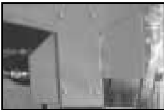
Unique sanitizing system sanitizer injector is located close to pump, allowing sanitizing to take place immediately. Strategic location eliminates chlorine damage to the machine.