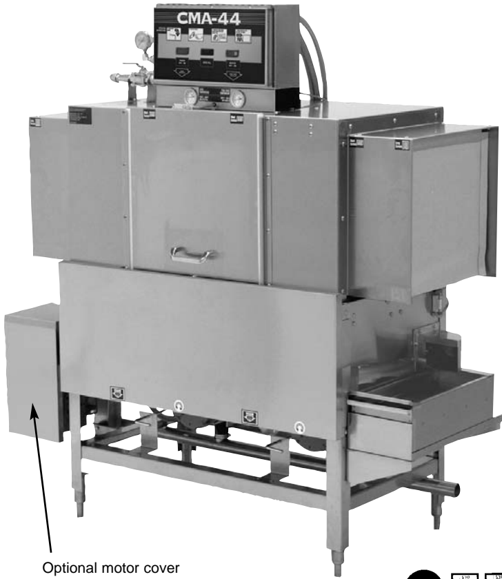
Optional motor cover