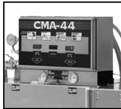
Top mounted controls include easy to read temperature gauges and complete operating instructions.