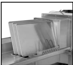
Large 19" high opening accommodates larger items and utensils.