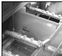
3-stage washing process provides pre-wash, power wash and final rinse all in a 44" machine.