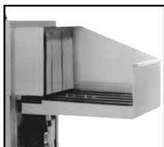
Shown with optional corner feed table. Available right or left.