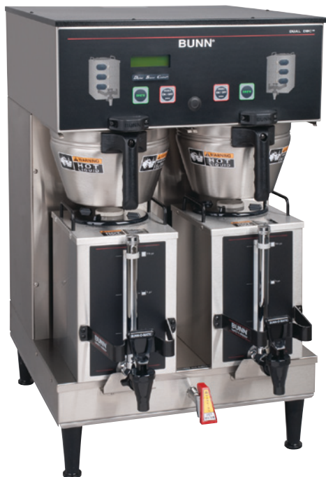
Dual GPR DBC with 1.5 gallon GPR Servers (included) Dimensions: 29.3 H x 18" W x 20" D (74.4cm H x 45.7cm W x 50.8cm D)