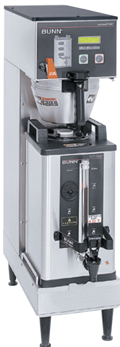
Single SH DBC with 1.5 gallon SH Servers (servers sold separately)

Dimensions: 35.8" H x 9.3" W x 21.2" D (90.9cm H x 23.6cm W x 53.8cm D)