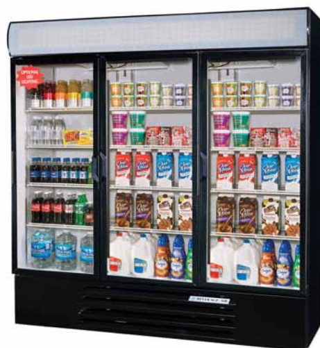
LV72Y (shown with 4 shelves per section)