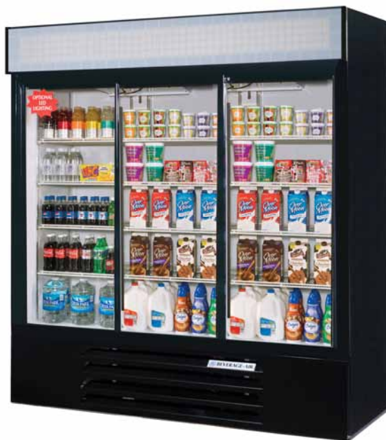
LV66Y (shown with 4 shelves per section)