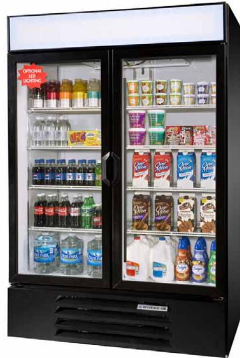
LV49 (shown with 4 shelves per section)