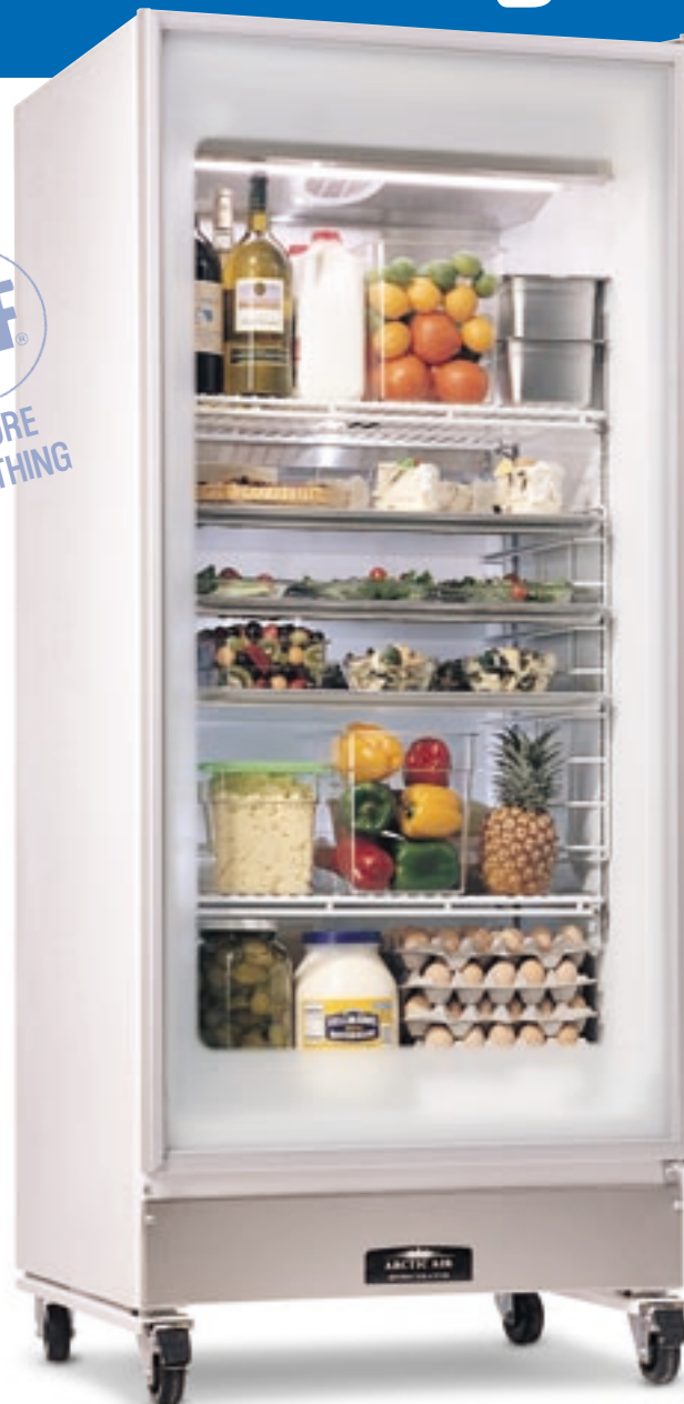
Refrigerator Model GDR22CWR (Shown with optional pan slide kit.)

Store anything ANSI/NSF Standard 7 certification. Approved for storing open food containers. A great value usually at $700-1000 less than competitive brands.