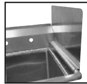
K-700 Removable Side Splashes Fits Left OR Right Side