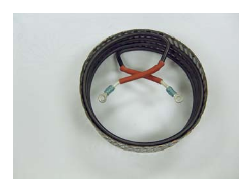
Step 7 – screen assembly removed from spinning head.