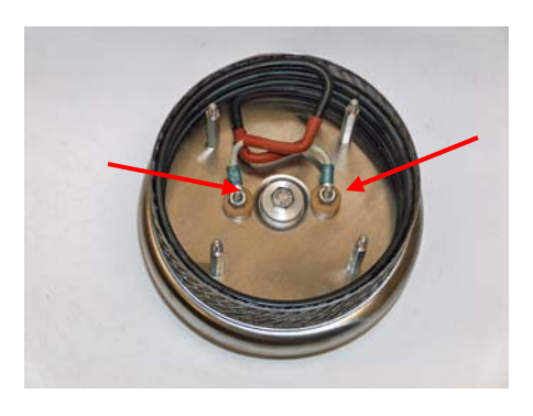
Step 6 – disconnect the two heater lead terminations by removing 2 nuts..