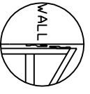
FIG. 3 ATTACH Z CLIPS TO WALLS TO MATCH